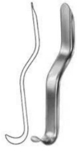
Cawood-Minnesota RI-14-115-15 Cheek Retractor 15 cm,