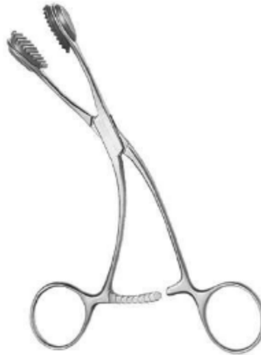
Young RI-14-126-17 Tongue Holding Forceps 15 cm,