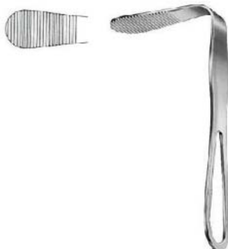
Hartmann RI-14-117-15 Tongue Depressor 15 cm,