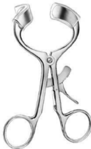
Molt RI-14-105-11 Mouth Gag 11 cm,