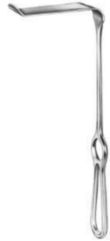
Obwegeser RI-14-127-40 Soft Tissue Retractor 21.5 cm,