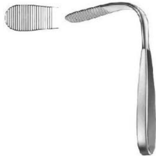
Tobold RI-14-119-14 Tongue Depressor 14.5 cm,