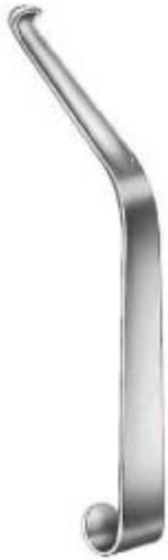
Obwegeser RI-14-131-18 Channel Retractor 17 cm,