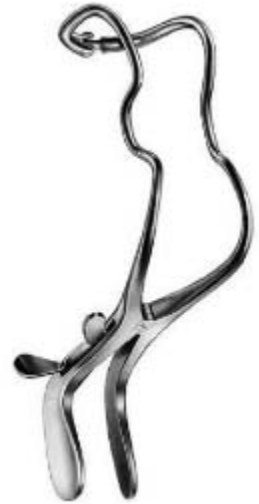
Jennings RI-14-109-09 Mouth Gag 10.5 cm,