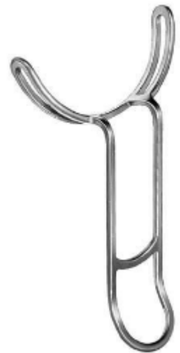
RI-14-112-14 Vestibulum Retractor 14 cm,