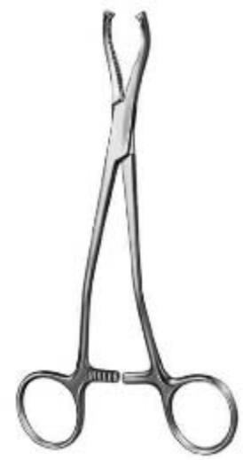
Jeter-Van Sickels RI-14-142-01 Bone Holding Forceps 18 cm,