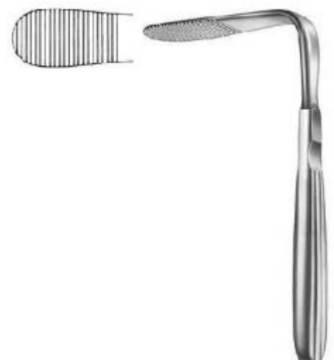
Tobold RI-14-118-14 Tongue Depressor 15 cm,