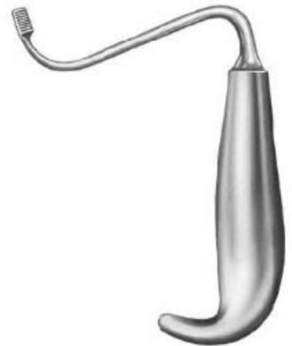
Gillies RI-14-136-21 Zygoma Elevator 20 cm,