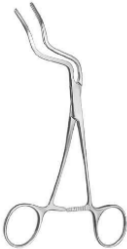
Smith RI-14-158-01 Sagittal Split Separator 17 cm,