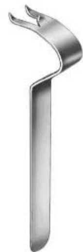
Obwegeser RI-14-130-16 Chin Retractor 16.5 cm,