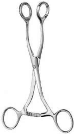
Collin RI-14-125-17 Tongue Holding Forceps 17 cm,