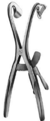
Denhart RI-14-106-12 Mouth Gag 13 cm,