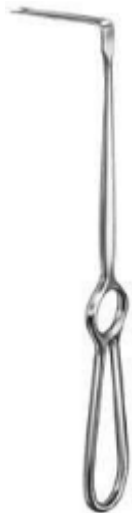
Obwegeser RI-14-128-22 Nasal Spine Retractor 22 cm,