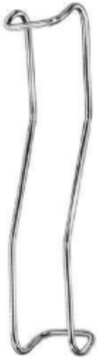
Sternberg RI-14-113-14 Lip and Cheek Retractor 14 cm,