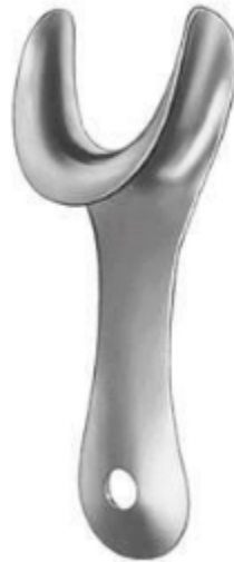
Martin-Simplex RI-14-111-11 Cheek Retractor 10.5 cm,