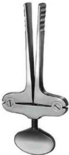
Heister RI-14-104-13 Mouth Gag 13 cm,