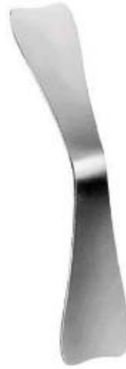
Doyen RI-14-123-18 Tongue Spatula 13.5 cm,