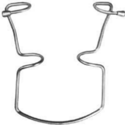
Oringer RI-14-110-00 Lip and Cheek Retractor 9.5 cm, 10 cm, 10.5 cm, 11 cm,