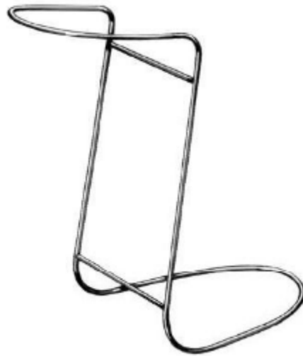
Obwegeser RI-14-114-12 Cheek Retractor 12 cm,