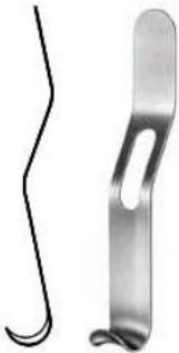
RI-14-116-00 Cheek Retractor 14.5 cm,