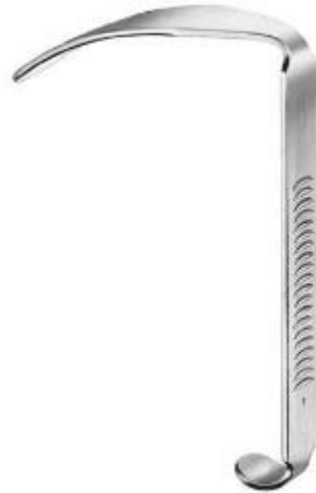
Roser-Knig RI-14-108-16 Mouth Gag 13.5 cm,