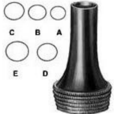
Zollner RI-12-115-00 Ear Specula, Set 3.8 cm,