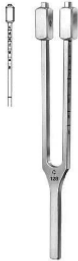
Hartmann RI-12-120-10 Tuning Fork c 128,