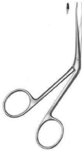
Hartmann RI-12-129-12 Ear Polypus Forceps 12 cm,