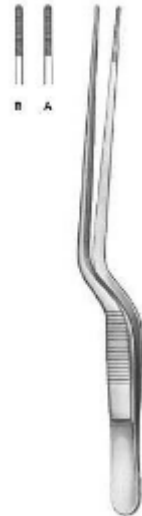
Jansen RI-12-127-16 Ear Forceps 16 cm, 21.5 cm,