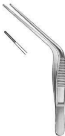
Troeltsch (Wilde) RI-12-123-11 Ear Forceps 10.5 cm,