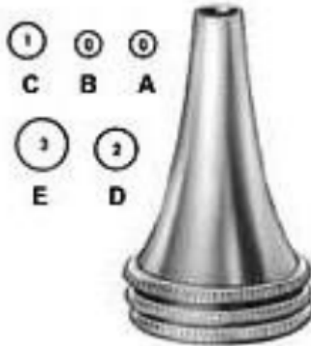
Hartmann RI-12-114-03 Ear Specula, Set 3.6 cm Fig. 0, 3.6 cm Fig. 1, 3.6 cm Fig. 2, 3.6 cm Fig. 3, 3.6 cm Fig. 4,