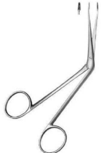
Hartmann RI-12-130-14 Ear Polypus Forceps 12 cm,