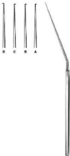
RI-12-110-01 Micro Ear Hook 0,3mm to 1,0mm 15.5 cm,