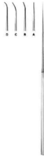
Barbara RI-12-109-01 Micro Ear Needle 0,3mm to 2,5mm 16 cm,