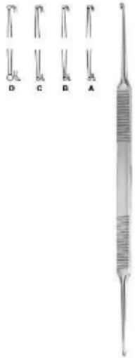
House RI-12-113-01 Micro Curette 14.5 cm,