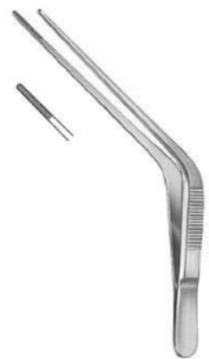
Troeltsch (Wilde) RI-12-124-12 Ear Forceps 11 cm,