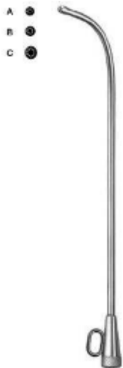
Hartmann RI-12-122-01 Ear Catheter 15 cm,