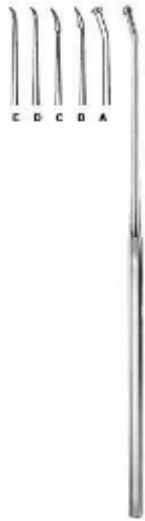
Schuknecht RI-12-107-02 Rotary Knife