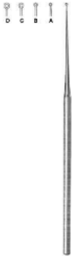
Buck RI-12-137-02 Ear Curette 17 cm,