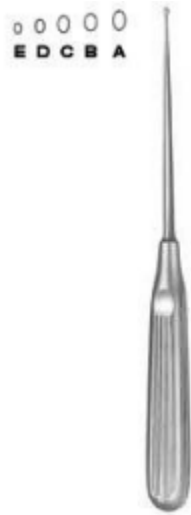
Lempert RI-12-149-10 Ear Scoop 21.5 cm,