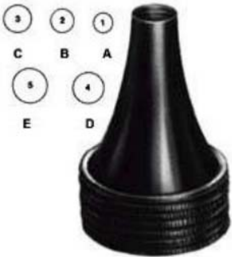
Farrior RI-12-116-01 Ear Speculum 3.6 cm,