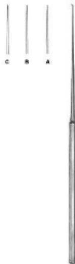
RI-12-111-06 Micro Ear Hook 0,3mm to 3,0mm, 25, 45, 90 degree