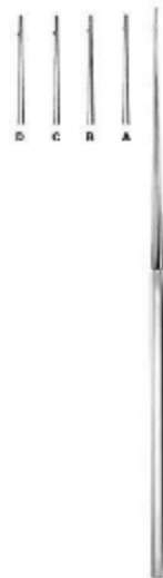
House RI-12-112-01 Micro Measuring Rod 15.5 cm 3,5mm, 15.5 cm 4,0mm, 15.5 cm 4,5mm, 15.5 cm 5,0mm,