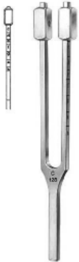
Lucae RI-12-119-10 Tuning Fork c 128,