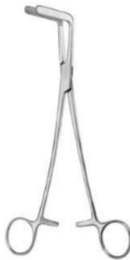
Wertheim-Cullen RI-5-502-21 Vaginal Clamp 21 cm,