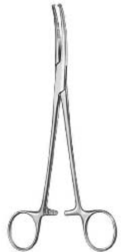
Mikulicz RI-5-512-21 Peritoneum Forceps 20.5 cm,