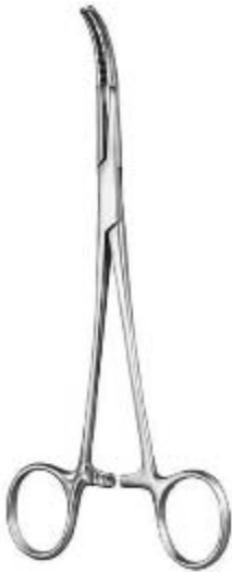
Mikulicz RI-5-510-20 Peritoneum Forceps 18.5 cm,