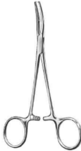
Mikulicz, Baby RI-5-508-14 Peritoneum Forceps 14.5 cm,