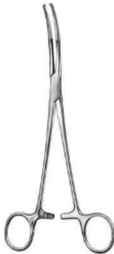
Mikulicz RI-5-511-20 Peritoneum Forceps 20 cm,