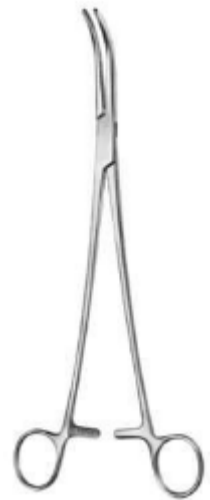
Wertheim RI-5-506-25 Hysterectomy Forceps 26 cm,