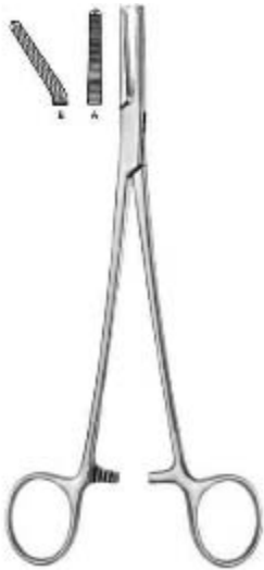
Phaneuf RI-5-501-21 Hysterectomy Forceps 20.5 cm,