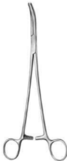
Moynihan RI-5-505-24 Hysterectomy Forceps 23.5 cm,