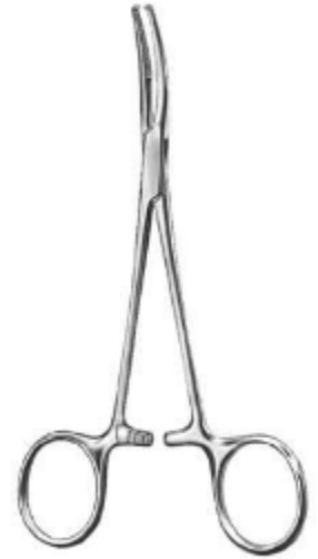
Mikulicz RI-5-509-18 Peritoneum Forceps 20.5 cm,