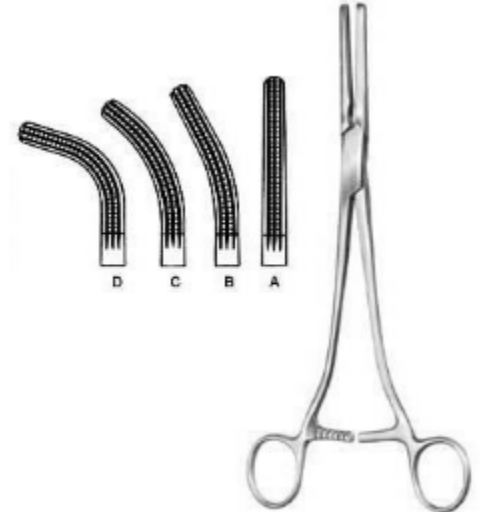
Rogers RI-5-503-10 Hysterectomy Forceps 21.5 cm Fig. 1, 21 cm Fig. 2, 20.5 cm Fig. 3, 20 cm Fig. 4,